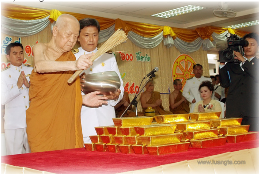
14.) 600 kg of Gold on 19th of December 2007