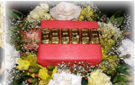
The Supreme Patriarch offers Gold to Luangta Mahā Bua

had helped rescue Thailand out of its economic crisis and taught the Thai nation the Dhamma. Thailand's economy was flourishing again.