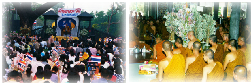
The project “Thais help Thailand”: gathering Gold and money to help the Thai economy

In the last years of his life, he started the project of “Thai people help the Thai nation” and announced it officially on the 12th of April 2541. Six years later on the 12th of April 2547, with Her Majesty the Queen present (over those years she attended quite a few of his public functions), he officially announced the end of the project. Within these years he had collected more than 10 tons of pure gold, more than 10 million US dollars and about 800 million Baht! During these years he traveled through nearly all of Thailand, receiving invitations from government officials, heads of villages and mayors of towns, to come and receive donations of gold, US Dollars and Baht. He sometimes went to do two or three public functions a day, giving talks and sitting for hours to receive all the donations that were pouring in. At the start of the project he was already 84 years old, and 90 years of age when the project finished. It is beyond belief, that a person of this age could undertake all of these strenuous activities. All in all, on 14 occasions he offered (see appendix) the gold and US Dollars he had received, to the Thai Nation, to be stored in in the Central Bank of Thailand. He