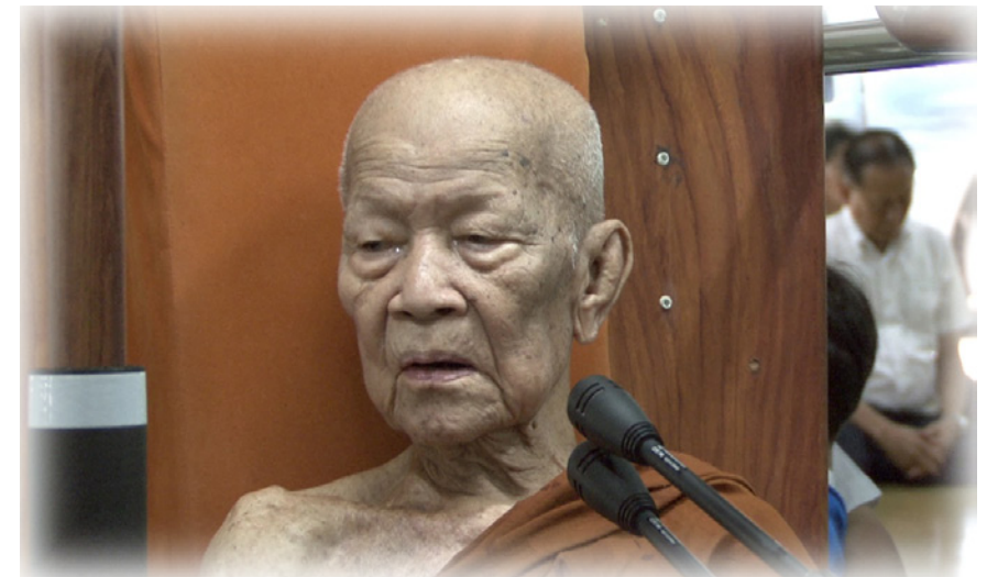
Luangta Mahā Bua half a year before he passed away, still giving advice and being there for the people

This all to say, that in the World of Dhamma, Luangta Mahā Bua has not left us with one dark spot. He has uncovered for us everything, that lay hidden. Turned every stone for us to see, just with one intention for us all – to help us to go the path to the end of dukkha, Nibbana, as fast as possible and with the least amount of hindrances possible!