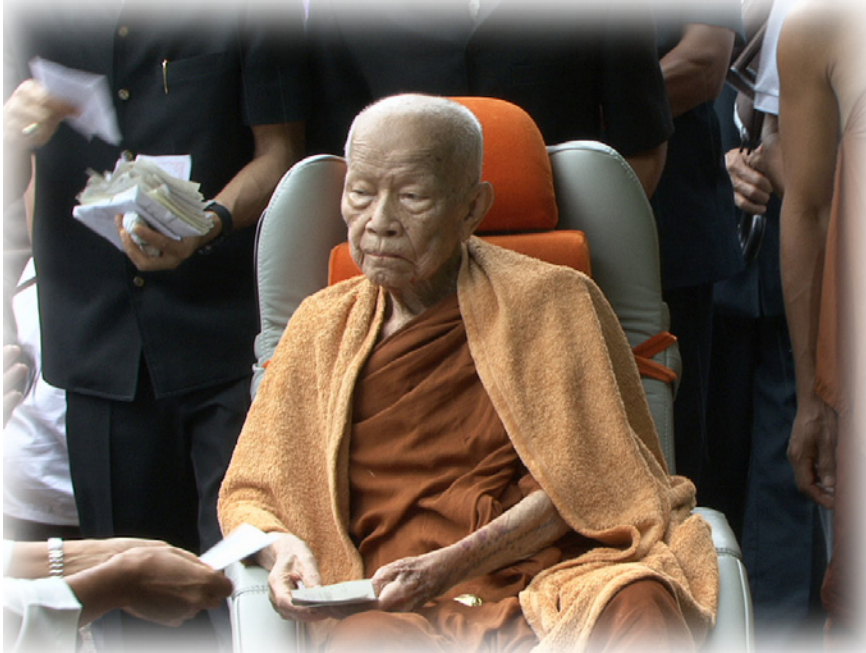
Luangta Mahā Bua just a few months before he passed away