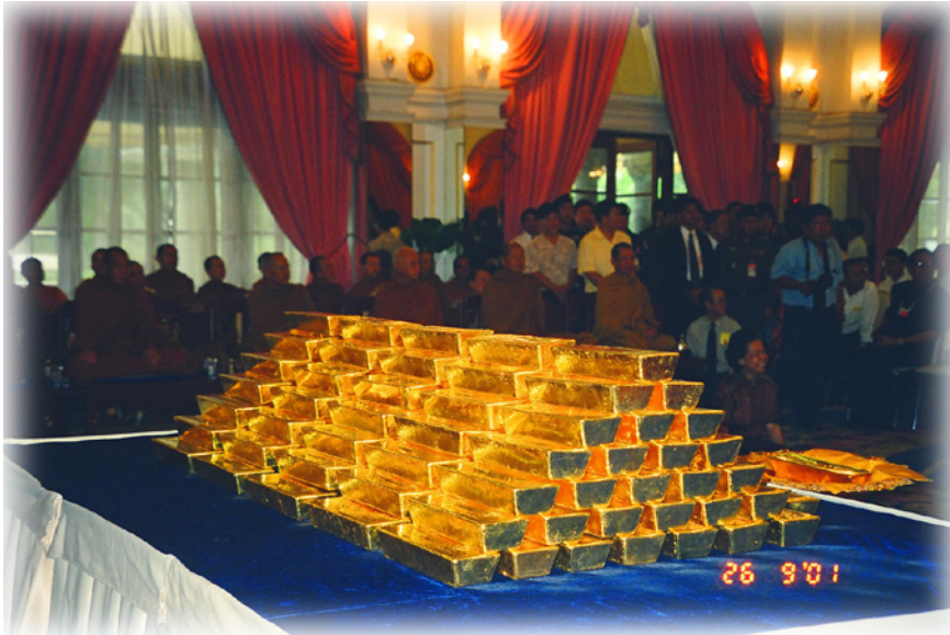
5.) 400,000 Dollars and 1811 kg of Gold on 26th of September 2001