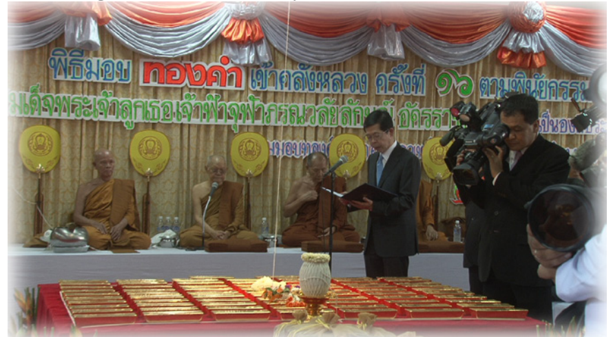
16.) 921 kg of Gold on 7th of May 2011

totalling into 13 tons of Gold and 8 kg and 10 Million and 803 thousand and 600 Dollars!