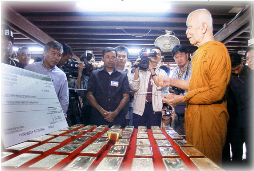
10.) 300,000 Dollars and 1025 kg of Gold on 26th of July 2003