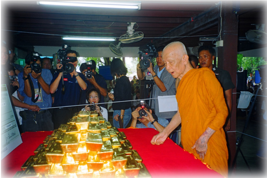
9.) 432,000 Dollars and 612 kg of Gold on 10th of July 2003