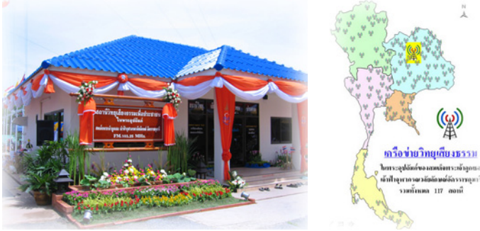
The mother radio and TV station in Baan Taad, and its substations.

Dhamma talks. Laypeople established a Dhamma radio station, 24 hours of uninterrupted Dhamma talks, where his daily talks were also broadcast live. All over the country 117 radio substations were established, so that nearly everybody in Thailand could listen to this Dhamma radio. In 2541 laypeople established a website for him, known as www.luangta.com , that a few years later was transferred to Wat Pa Baan Taad to be run by his monks. This became the only official website about him and his wealth of Dhamma. He allowed only his own monks to be responsible for the contents of this website. From September 2542, not only were his talks recorded as audio, but some were also recorded as videos. Later on, around 2546 his daily talks, be it in Wat Pa Baan Taad, or in SuanSaengtam, his branch monastery in Bangkok, were broadcasted live, as audio or video on his website. Later on, wherever he went, all of his public talks were broadcast live. So people all around the world could hear what he had to say. A few years later his public appearances and his public Dhamma talks were not only broadcast live via the internet, but also through his own TV station.