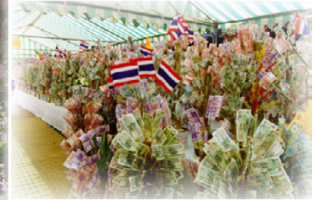
Thais offering money and gold “trees” to Luangta Mahā Bua