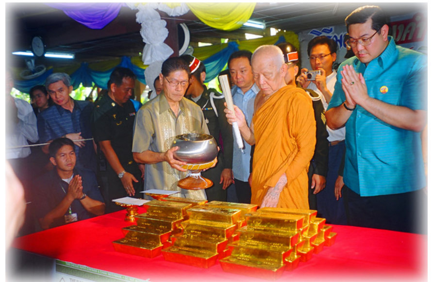
8.) 400,000 Dollars and 525 kg of Gold on 10th of December 2002