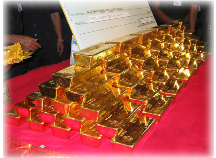
11.) 500,000 Dollars and 1400 kg of Gold on 26th of December 2003