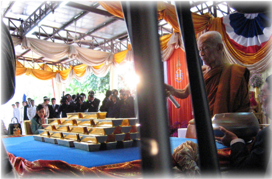
14.) 600 kg of Gold on 19th of December 2007